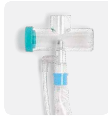
Also available with T-piece adapter